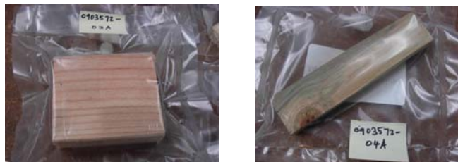
Photos of wood samples in evacuated 1L Tedlar bags.

Air samples from the wall chambers were shipped to Air Toxics, LTD. in Folsom, CA or Lakeland Laboratories in Lakeland, FL for analysis via ASTM D-5504